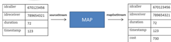
Figure 2: Example of Map operator.

Figure 2 shows an example of the Map operator. In the example the Map is used to transform the input tuples, with the schema [idcaller, idreceiver, duration, timestamp] representing a simplified Call Description Record (CDR) by adding a new field cost evaluated with the expression cost = duration * 10 + 10