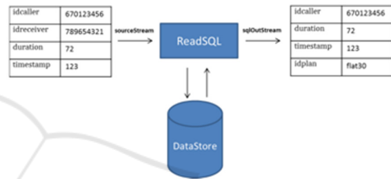
Figure 3: Example of ReadSQL operator.

Figure 3 shows an example of the ReadSQL operator. The operator receives CDRs and fetches from an external data store the monthly plan (idplan) of the user making the phone call. The output tuple is composed by the fields idcaller, duration and timestamp of the input tuple plus the idplan field read from the data store.