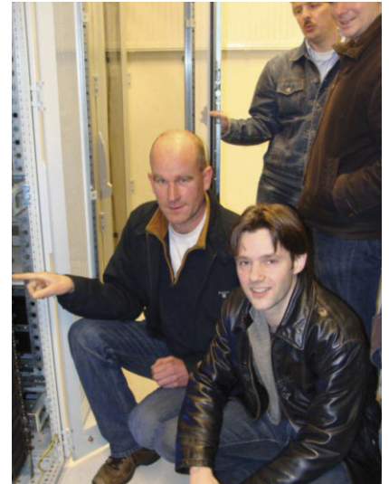
Proud researchers and their cluster.

the MapReduce runtime. We use Hadoop: an open source implementation of Google's file system and MapReduce. A small cluster of 15 low cost machines suffices to run experiments on about half a billion web pages, about 12.5 TB of data if uncompressed. To give the reader an idea of the complexity of such an experiment: An experiment that needs two sequential scans of the data requires about 350 lines of code. The experimental code does not need to be maintained: In fact, it should be retained in its original form to provide data provenance and reproducibility of research results. Once the experiment is done, the code is filed in a repository for future reference. We call our code repository MIREX (MapReduce Information